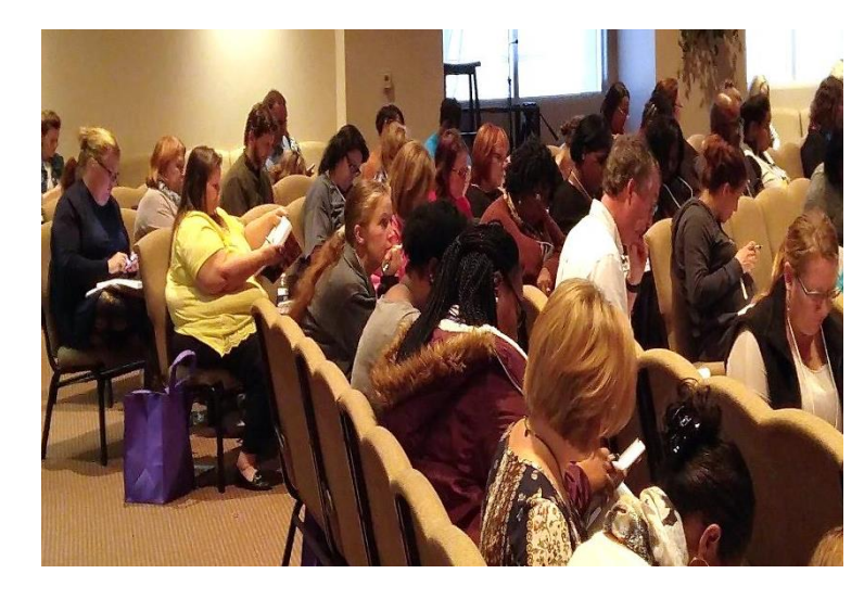
Self-Advocates and Caregivers are focused on key concepts and the best ways to empower themselves.