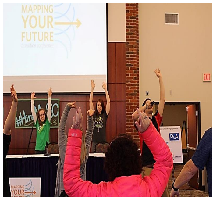
Mapping Your Future Participants get excited!